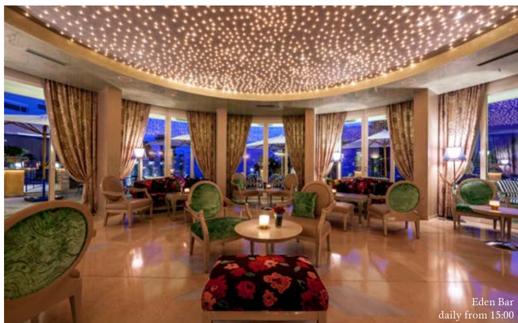
Eden Bar daily from 15:00

Carcani: Fresh pasta and delicious patisserie. Wednesday–Sunday from 07:30–18:00 (7.1.–1.3.2018 closed)